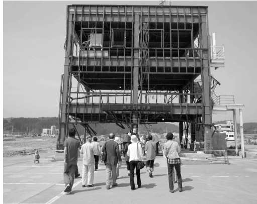
Photo 2: Minami-Sanriku Bosai-chosha (Town Building for Disaster Prevention) destroyed by the tsunami